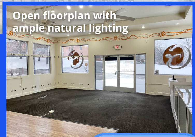
Open floorplan with ample natural lighting