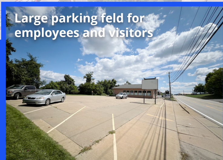
Large parking field for employees and visitors

EXPERIENCE PRIME RETAIL VISIBILITY, EASY HIGHWAY ACCESS, AND STRONG CONSUMER TRAFFIC NEAR THE HEART OF ROBINSON'S RETAIL CORRIDOR.