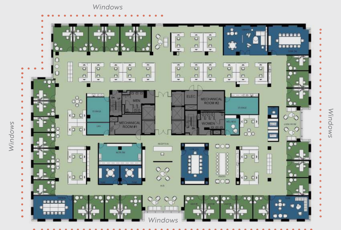
HYPOTHETICAL OFFICE INTENSIVE PLAN