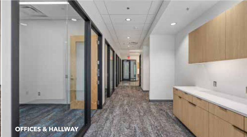
OFFICES & HALLWAY