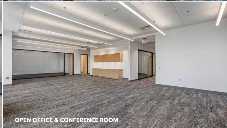
OPEN OFFICE & CONFERENCE ROOM