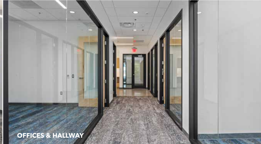
OFFICES & HALLWAY