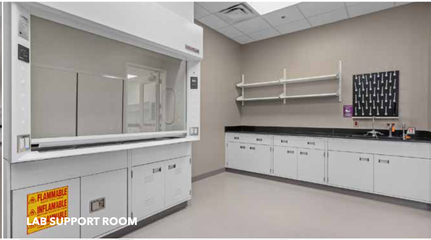
LAB SUPPORT ROOM