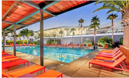
The Resort at Playa Vista