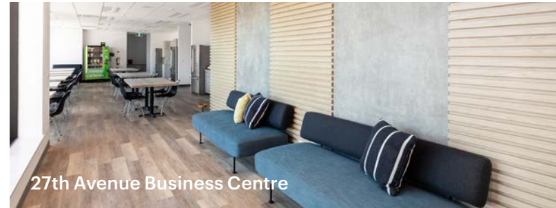
27th Avenue Business Centre