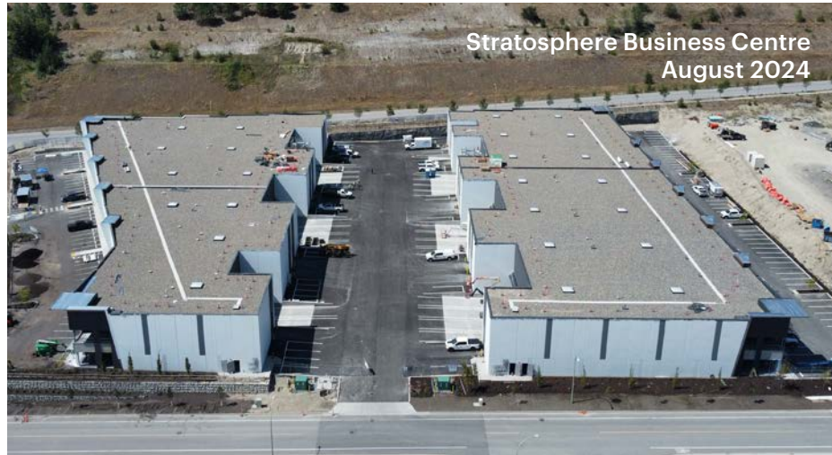
Stratosphere Business Centre August 2024