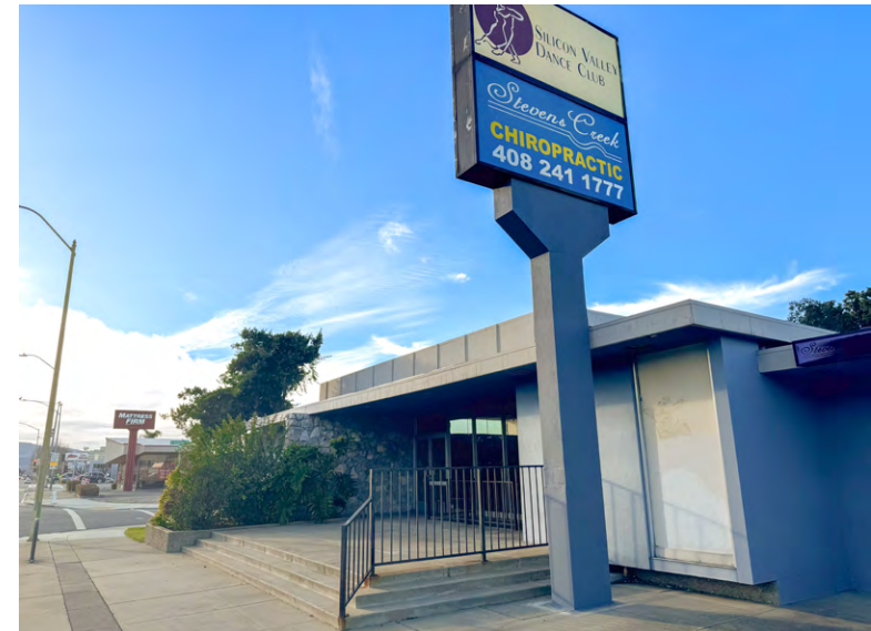
Entrance from Stevens Creek (Street View)