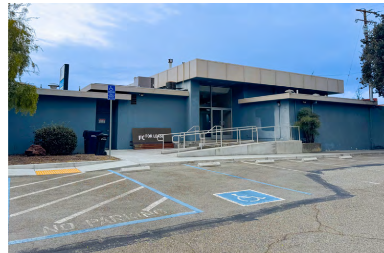
Entrance from parking lot