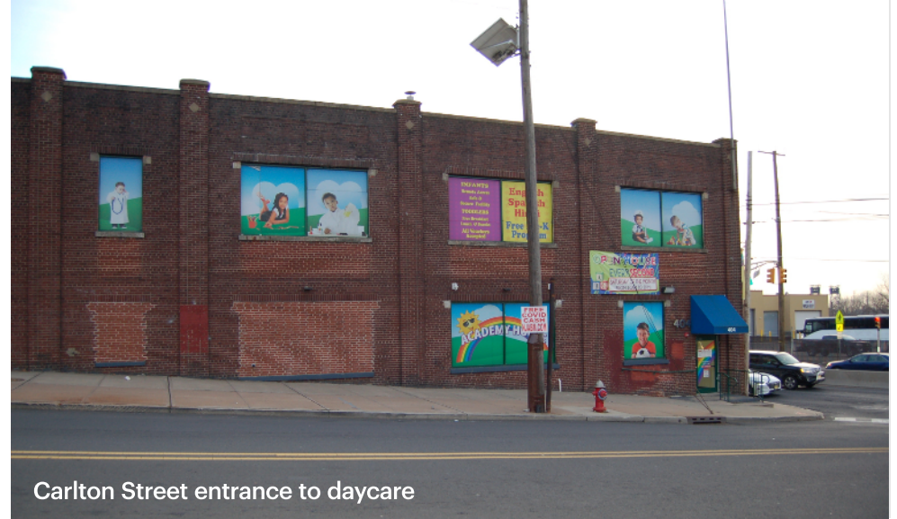
Carlton Street entrance to daycare