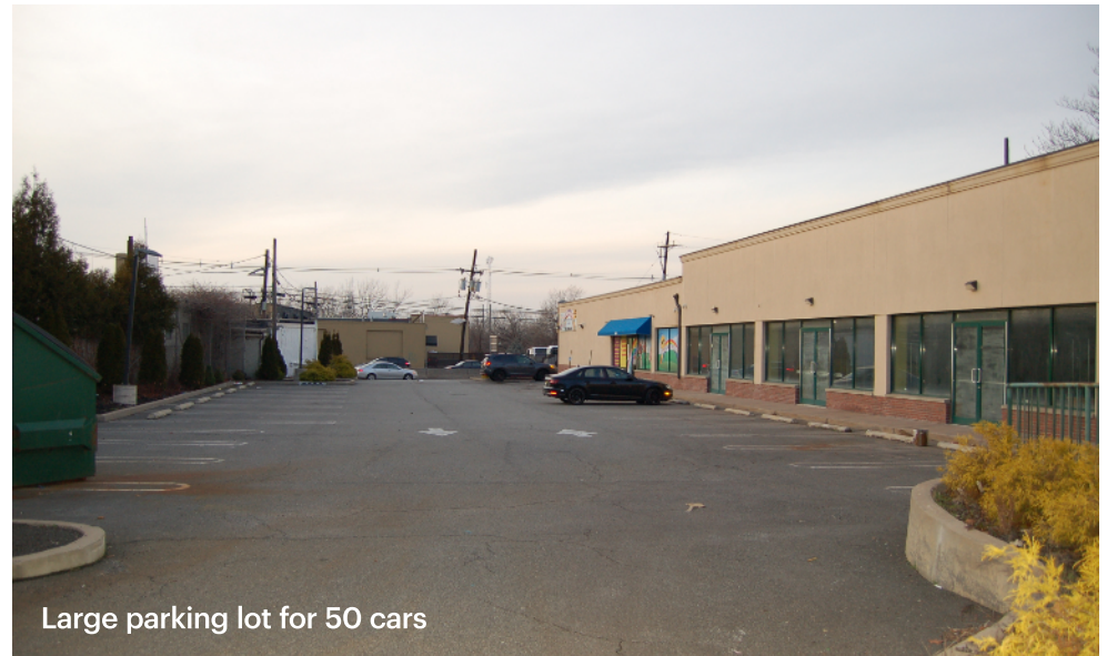
Large parking lot for 50 cars