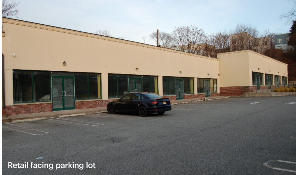
Retail facing parking lot