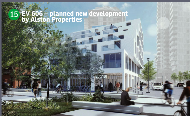
15 EV 606 – planned new development by Alston Properties