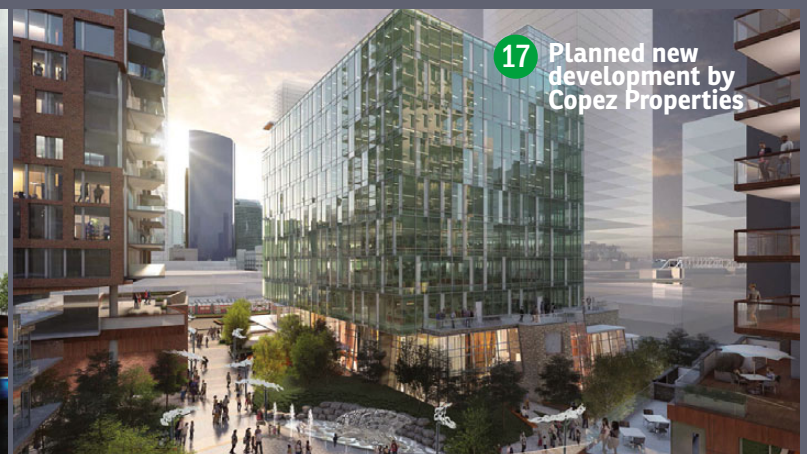
17 Planned new development by Copez Properties