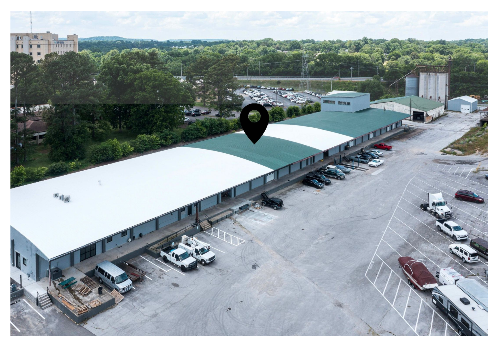
423 Westover Drive, Columbia, Tennessee