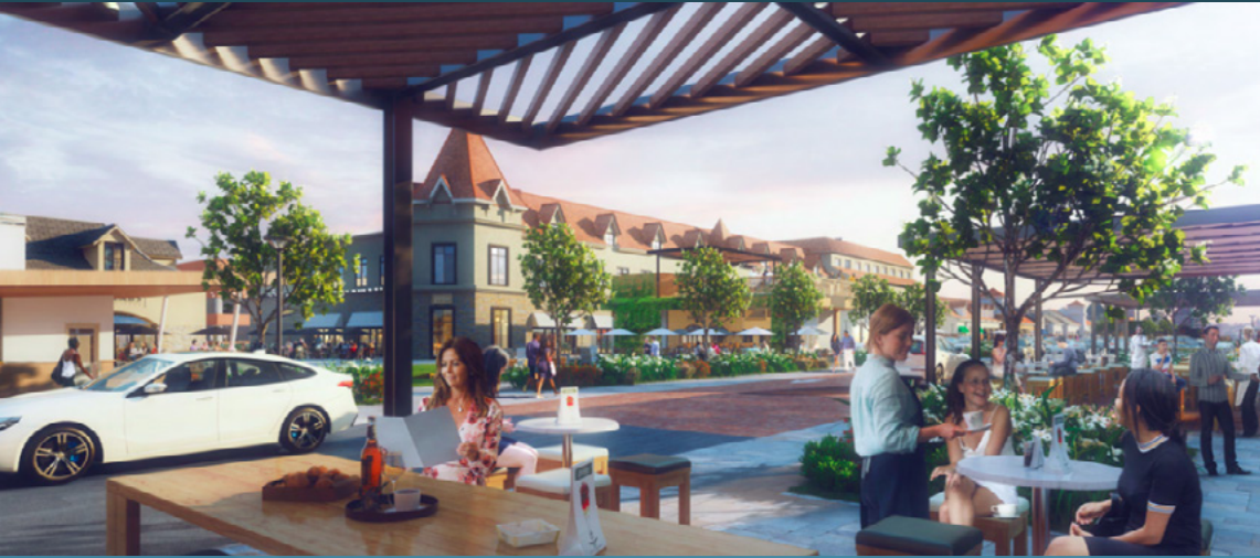
THE FORUM - REDEVELOPMENT UNDERWAY CLICK TO LEARN MORE