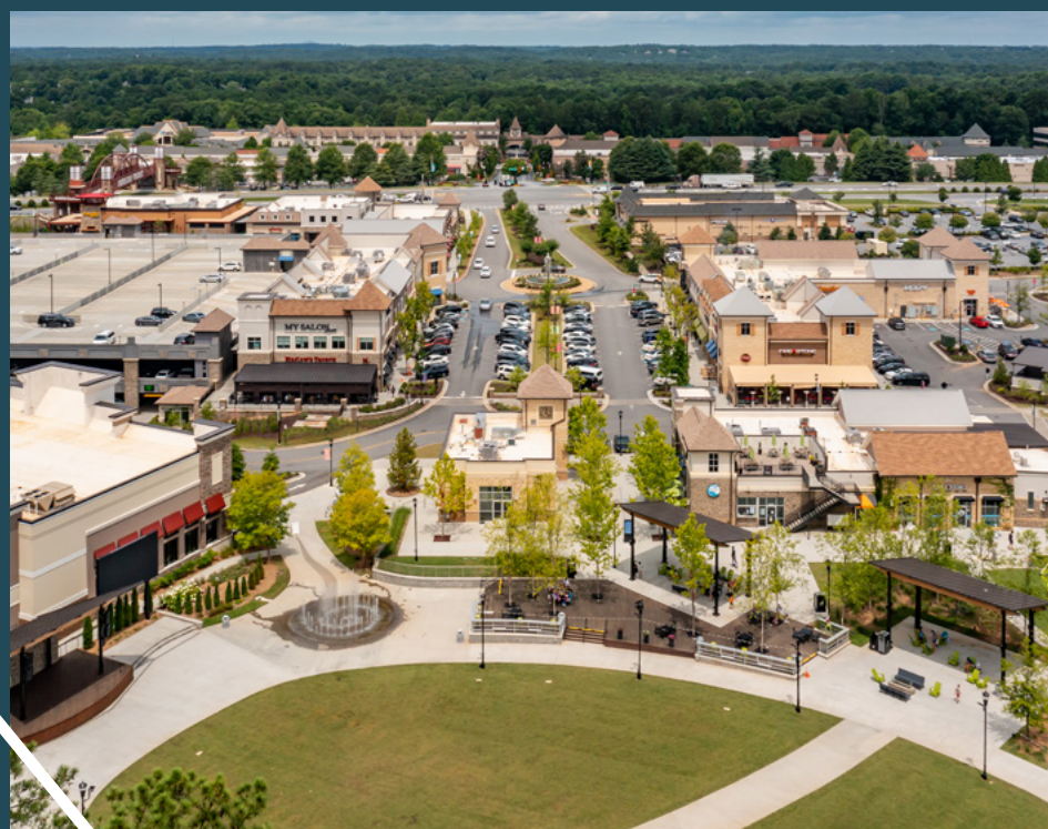
PEACHTREE CORNERS TOWN GREEN