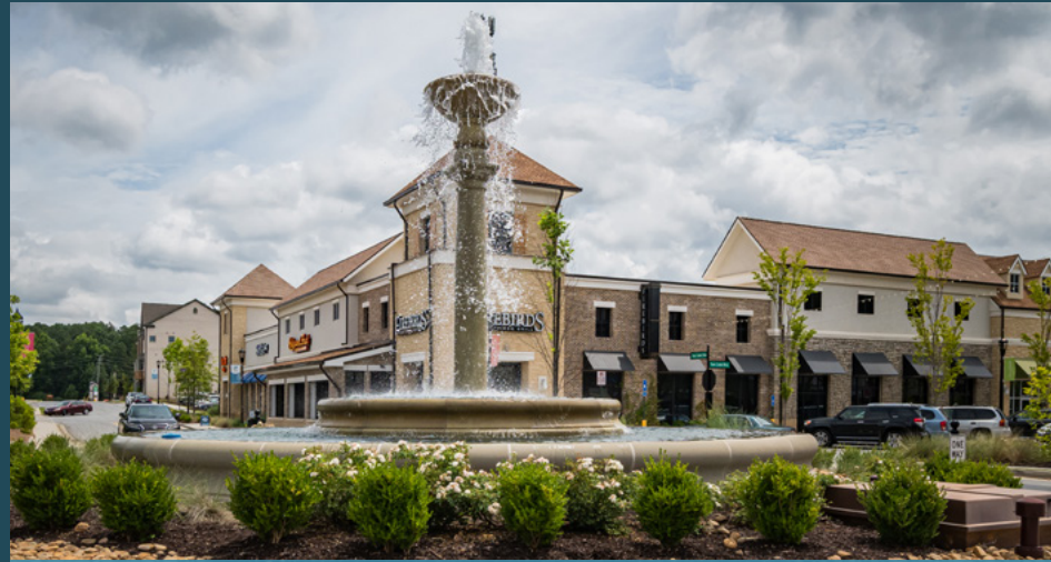
PEACHTREE CORNERS TOWN CENTER