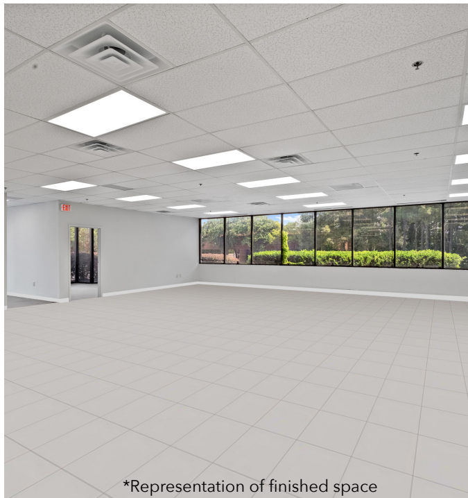
*Representation of finished space