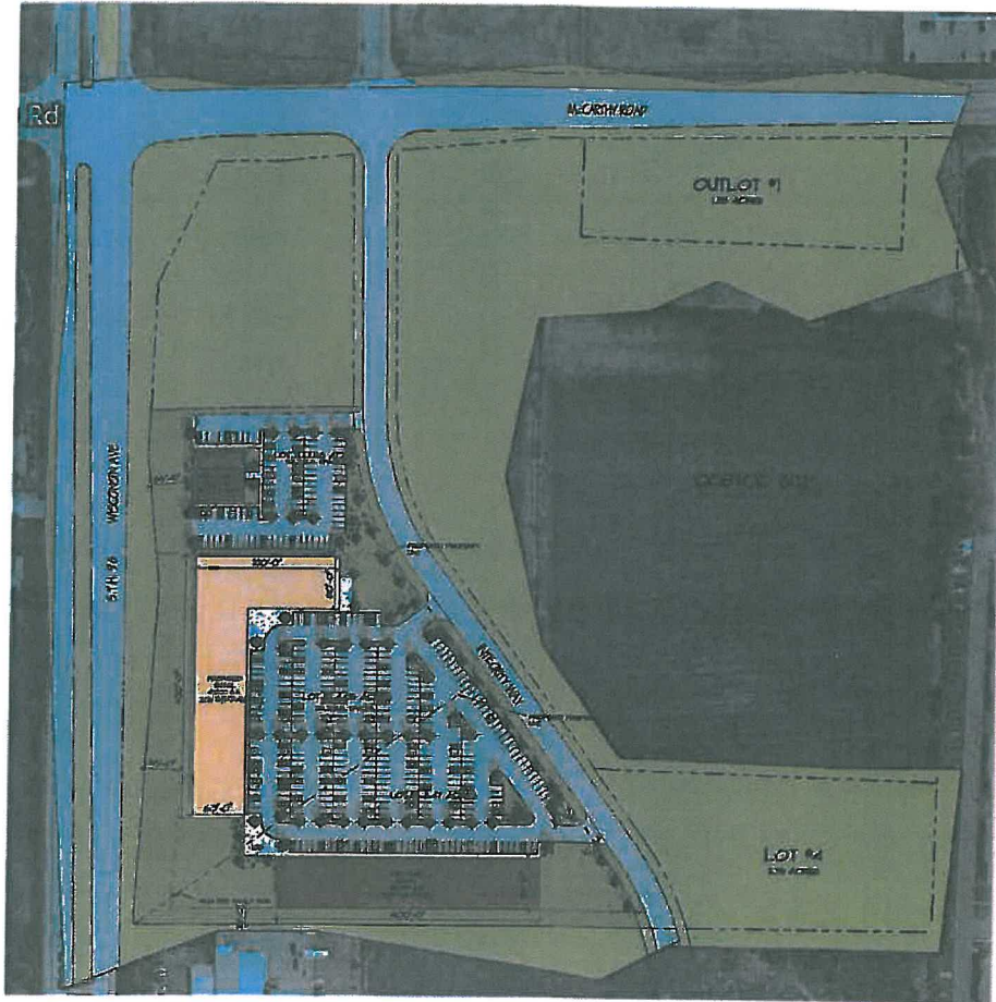
CONCEPTUAL SITE PLAN OPTION I 1/20