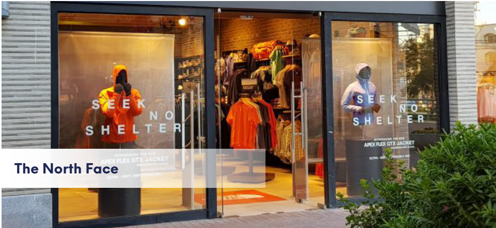
The North Face