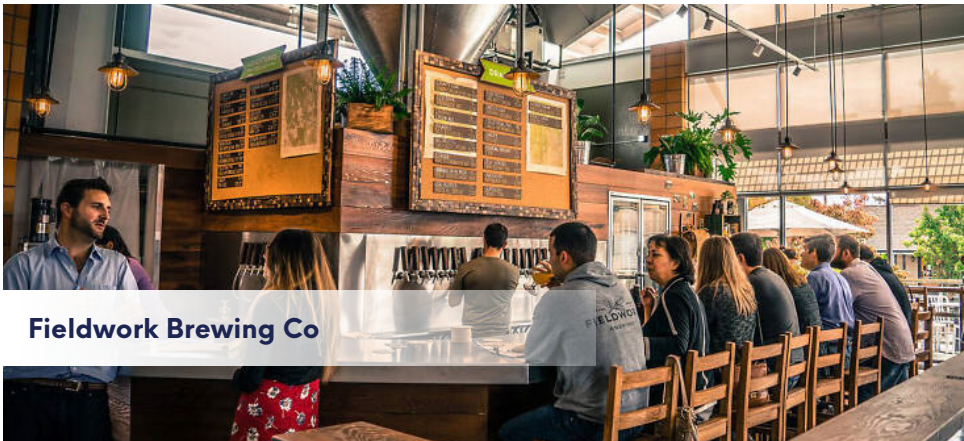
Fieldwork Brewing Co