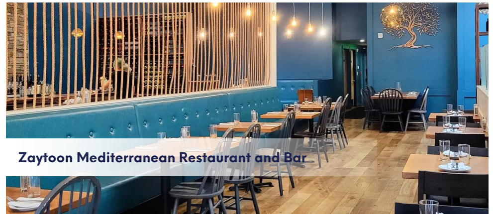
Zaytoon Mediterranean Restaurant and Bar