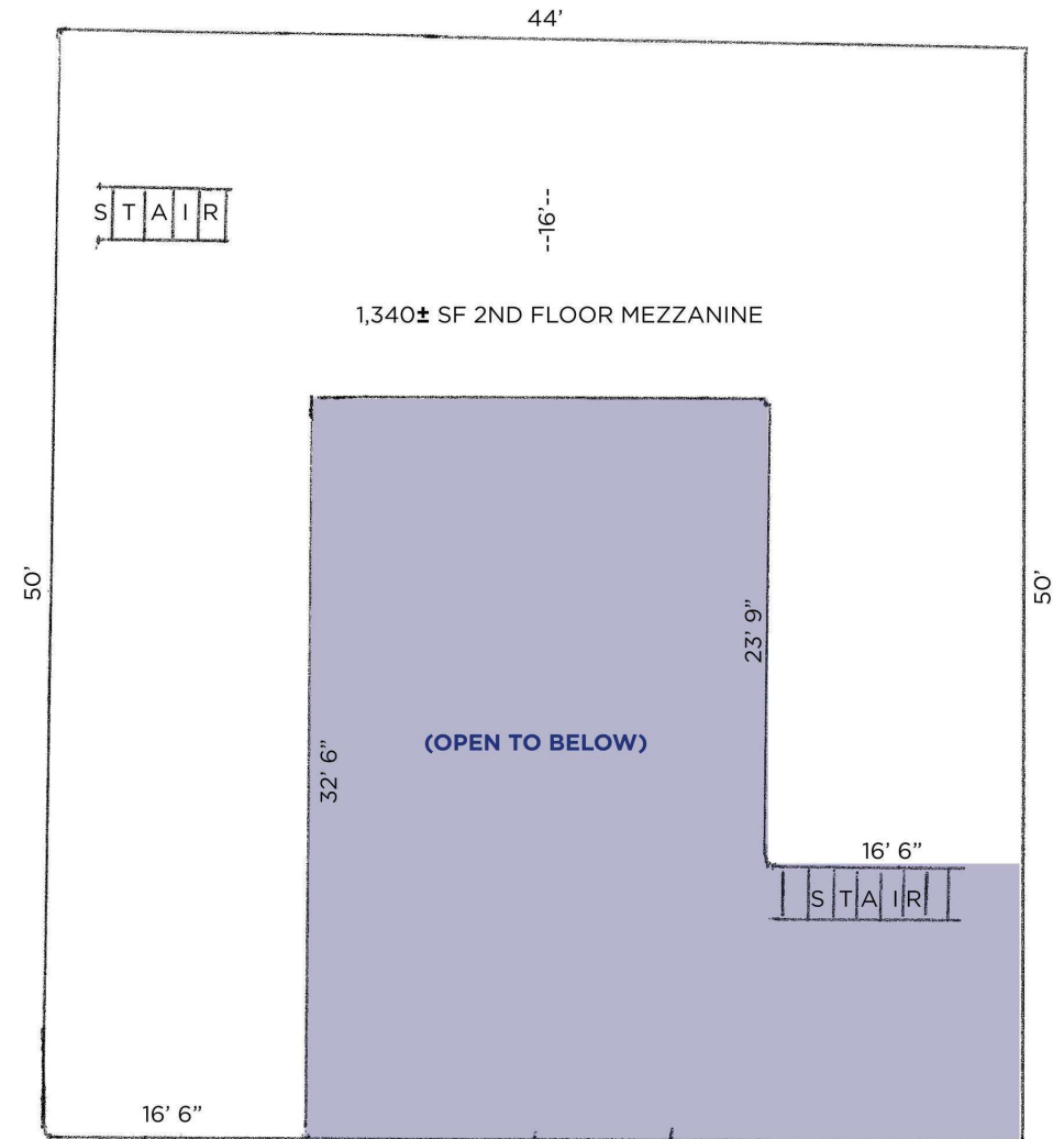
Second Floor Mezzanine