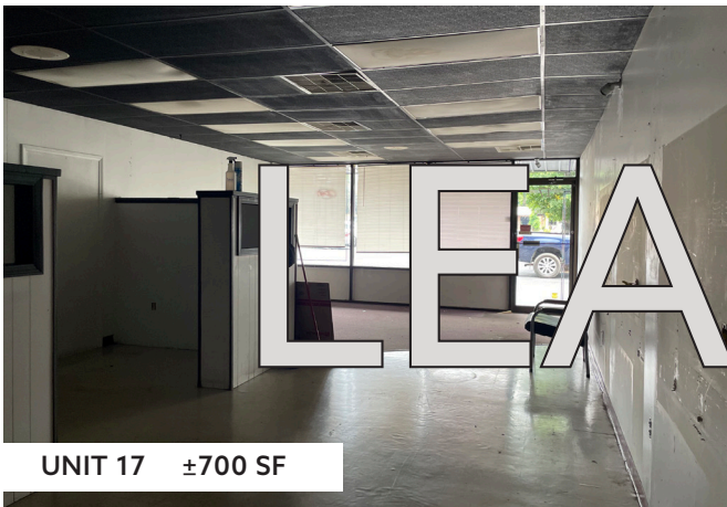
UNIT 17 ±700 SF