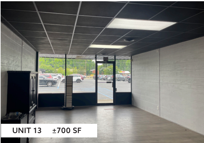
UNIT 13 ±700 SF