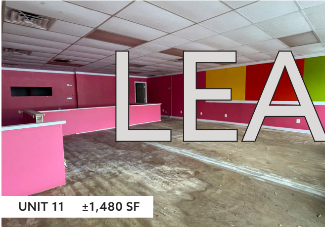
UNIT 11 ±1,480 SF

E. MAIN ST AT WEBBER RD . SPARTANBURG . SC 29307