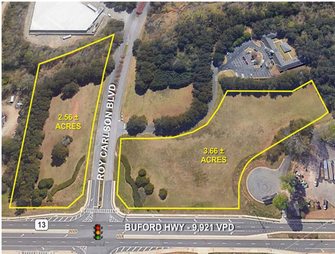
Buford Hwy at Roy Carlson Blvd | Buford, Georgia 30518