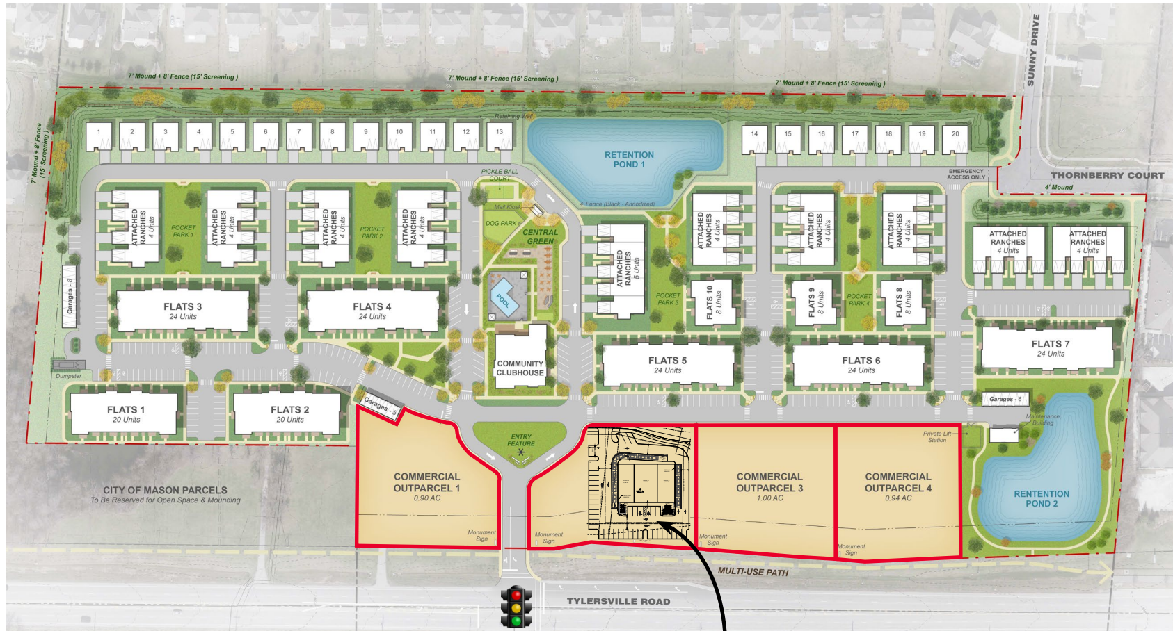
Example of small shop retail center with drive-thru

TYLERSVILLE RD & FIRESIDE DR, MASON, OH 45040