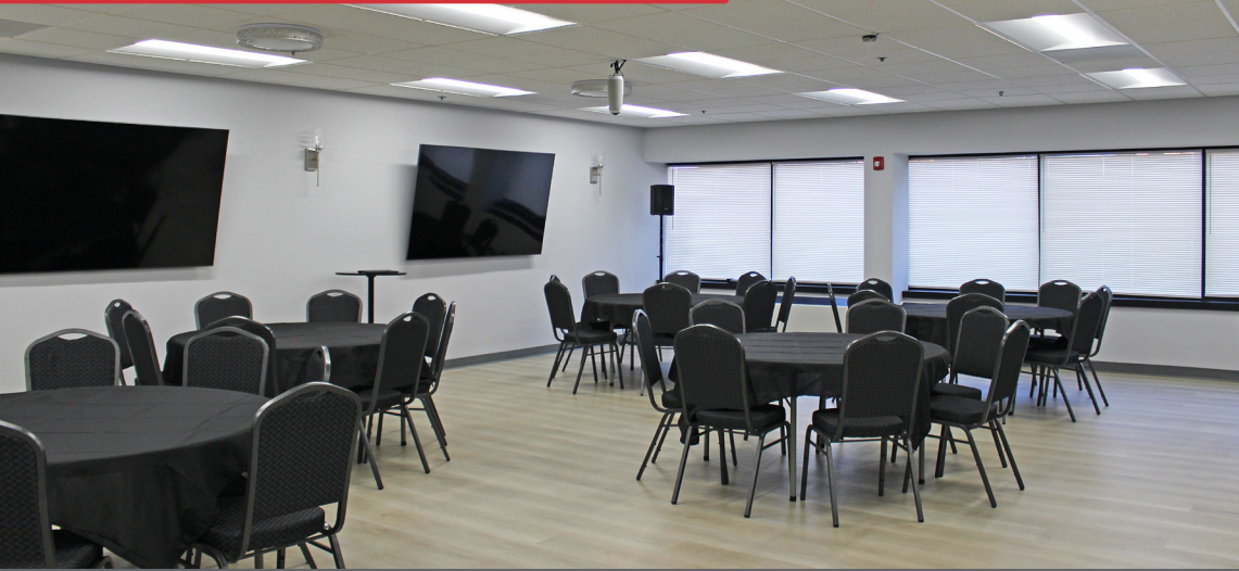
Brand new event space with seating areas & kitchen available for tenants