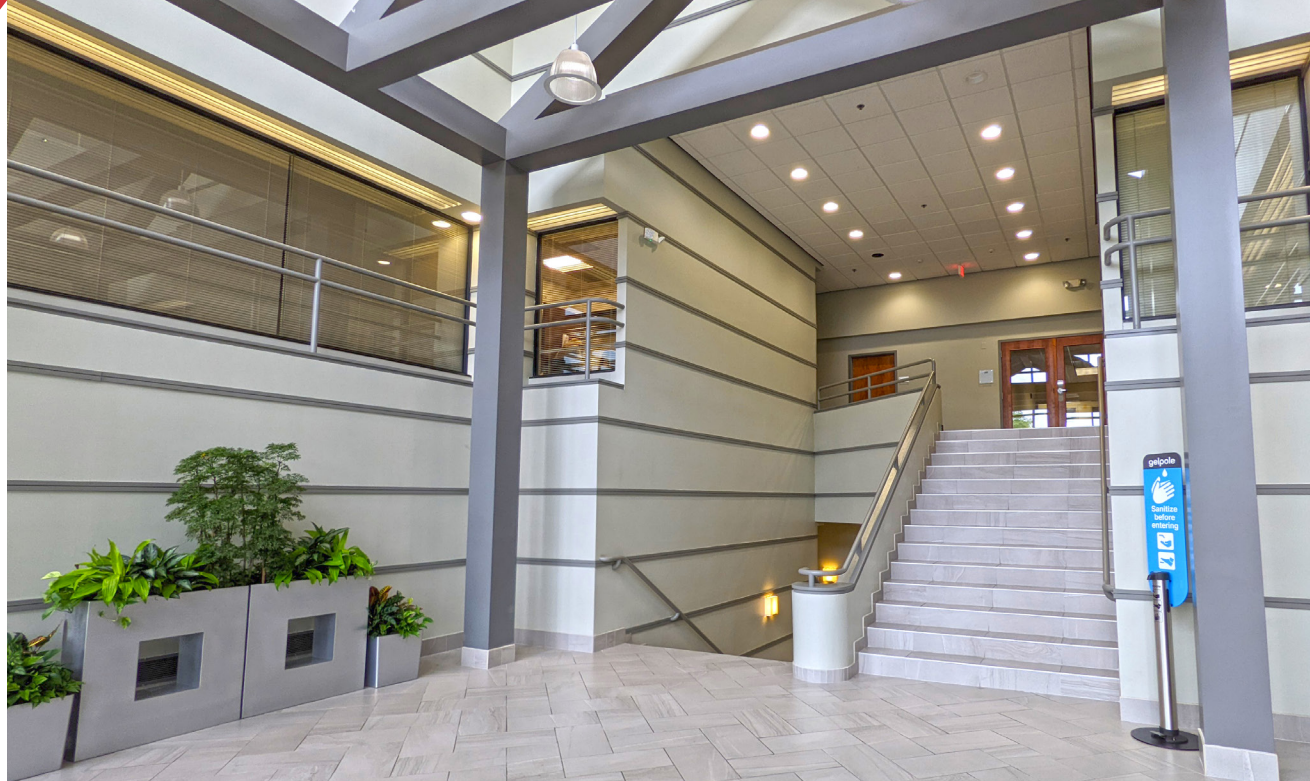
Beautiful atrium-style lobby with digital directory & seating