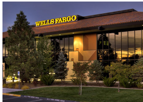
5340 Kietzke Lane, Reno 55,917 SF Class A Office