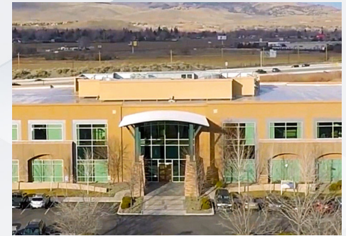
10345 Professional Circle, Reno 64,360 SF Class A Office