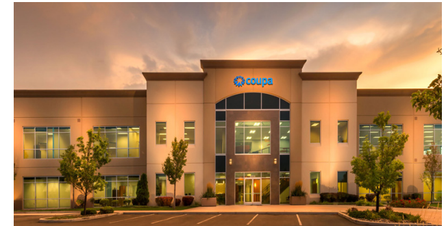
10615 Professional Circle, Reno 46,810 SF Class A Office