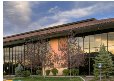
5370 Kietzke Lane, Reno 55,559 SF Class A Office