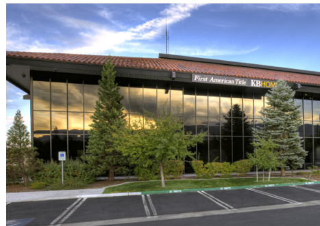
5310 Kietzke Lane, Reno 55,387 SF Class A Office