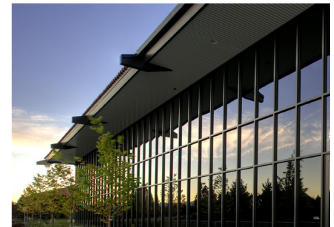
5390 Kietzke Lane, Reno 65,917 SF Class A Office