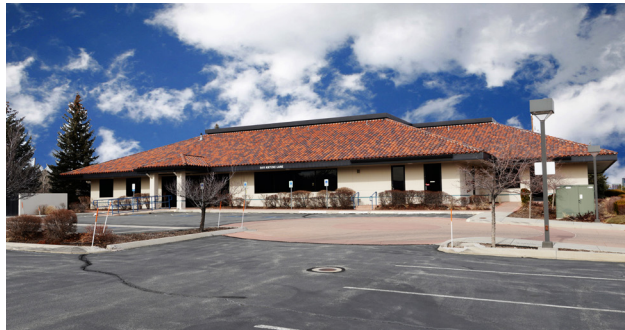
5411 Kietzke Lane, Reno 14,918 SF Class A Office/Medical