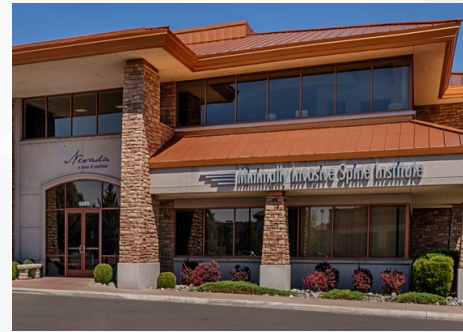
9990 Double R Blvd., Reno 20,549 SF Class A Commercial Office and Medical Building

NevDex Properties is Reno's premier landlord for Class A office space. We develop, own and manage approximately 420,000 rentable square feet in Reno, Nevada, including the NevDex Office Park. By providing creative deal structures with flexible lease terms, expansion rights and landlord sponsored improvement dollars, we offer the most professional and flexible leasing solutions that can help you thrive in today's rapidly changing work environment.