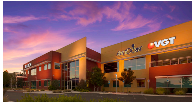
887 Trademark Drive, Reno 53,437 SF Class A Office