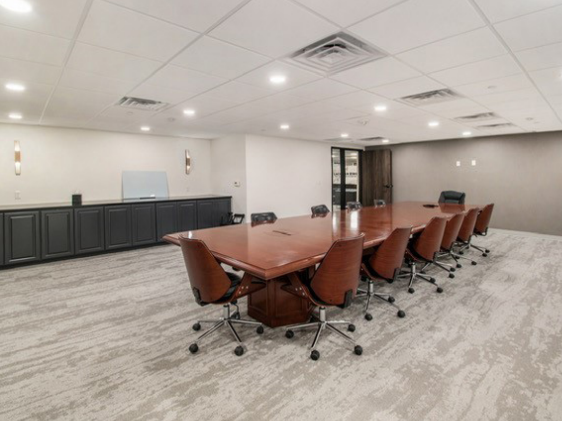
Suite 118-O continued