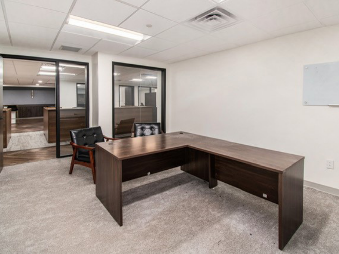
Suite 118-O continued