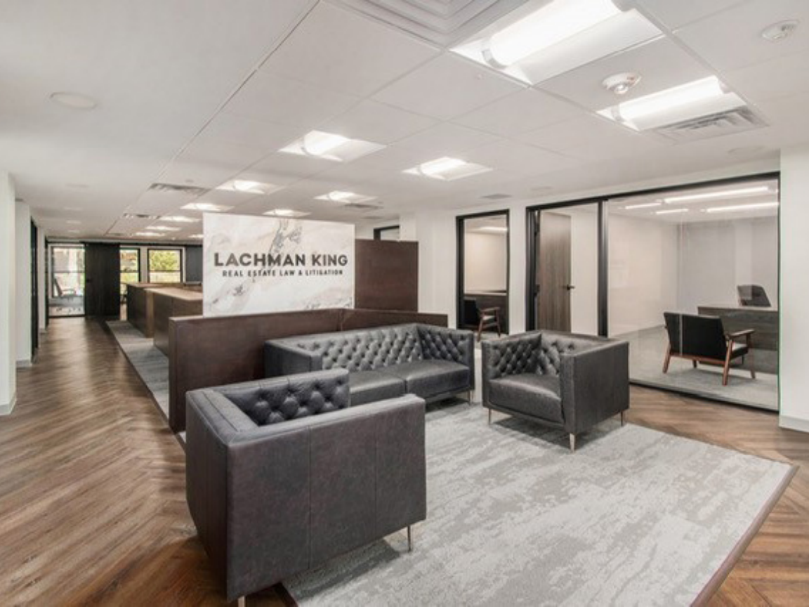
Pictured: Suite 118-O, a stunning 4,773 sq. ft. professional suite