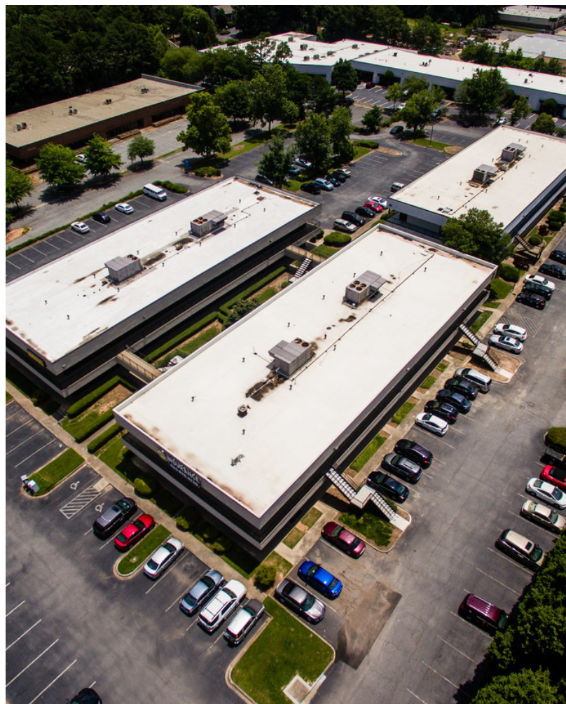
7094 PIB | 7094 Peachtree Industrial Blvd Peachtree Corners, GA 30071