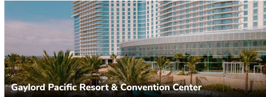
Gaylord Pacific Resort & Convention Center