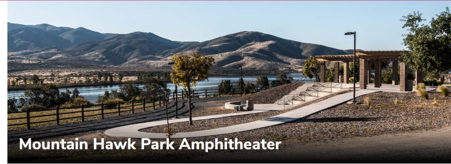
Mountain Hawk Park Amphitheater