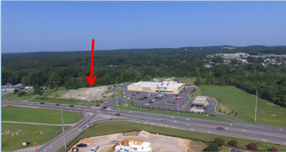
At the entrance to Walmart Neighborhood Market