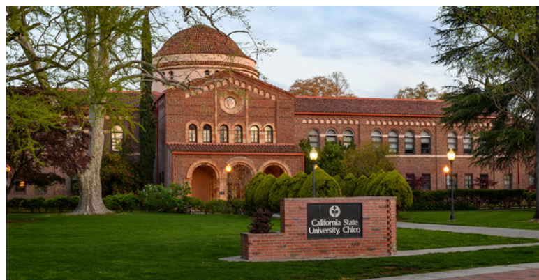
Pictured: CSU Chico, Bidwell Park, Sierra Nevada Brewery