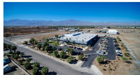
ERNIE BALL GUITARS

Directions: From I-10, take Expressway 86 south to Avenue 52. Turn right (west) on Avenue 52 to Enterprise Way. Take Enterprise Way left (south) to the site.