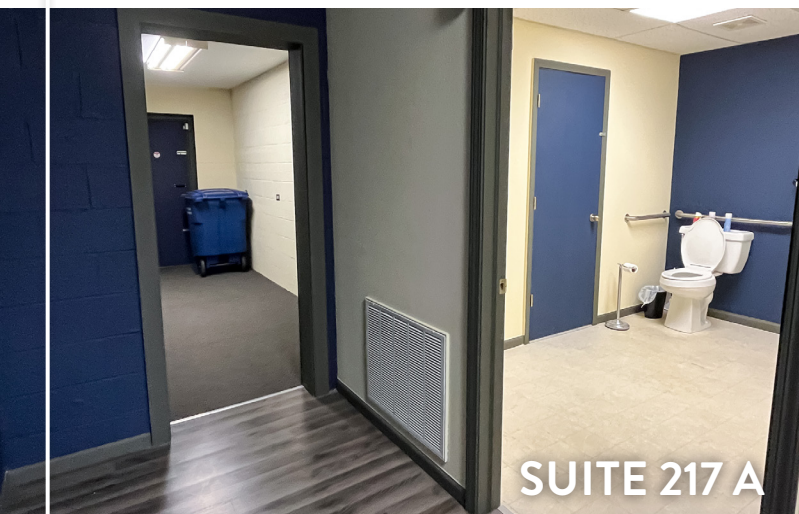
SUITE 217 A