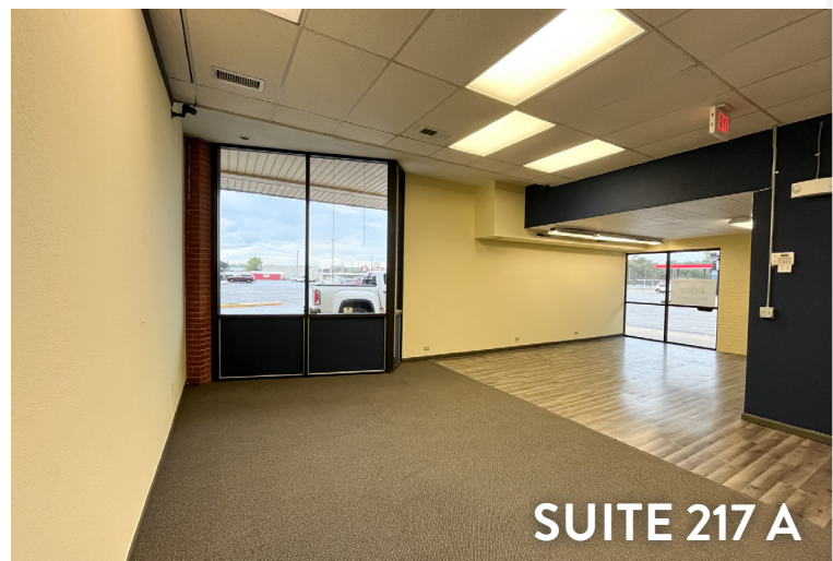
SUITE 217 A