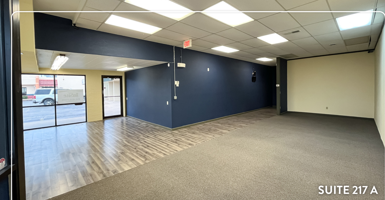
SUITE 217 A