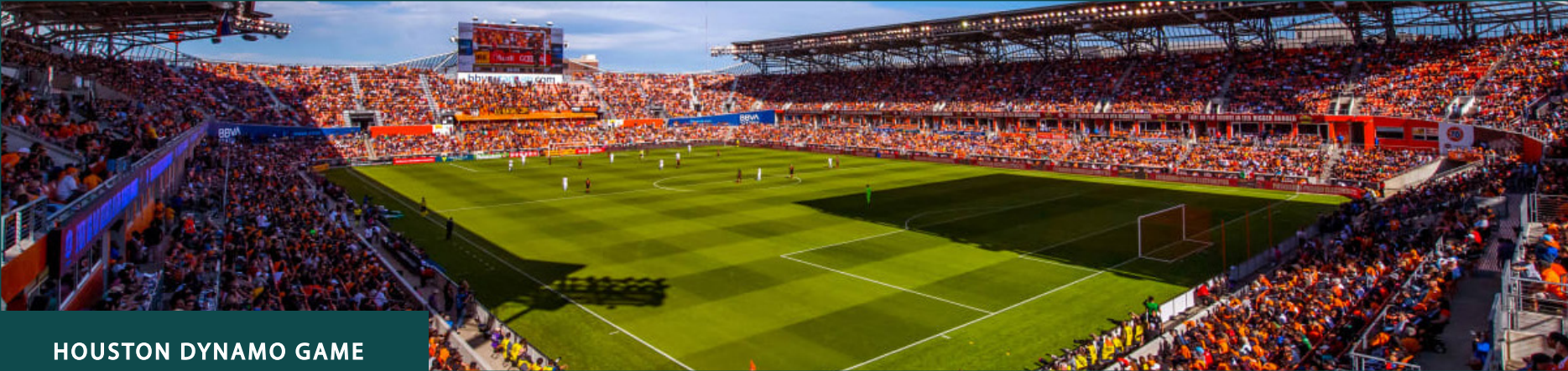
HOUSTON DYNAMO GAME