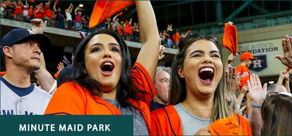
MINUTE MAID PARK

This energetic urban destination is the center for culture, lifestyles and commerce with sports, world-class theaters, innovative culinary options and outdoor green space at your fingertips.