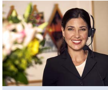
A receptionist to greet your visitors.