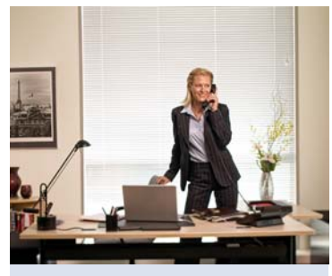
Fully equipped offices On-Demand