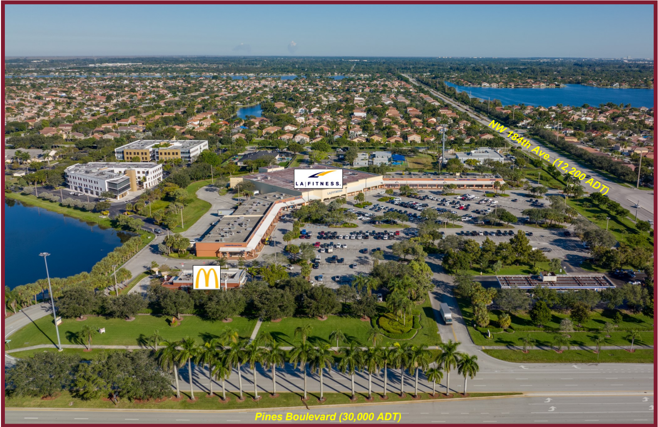
Pines Boulevard & NW 184 th Avenue, Pembroke Pines, FL