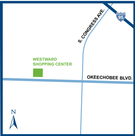
WESTWARD SHOPPING CENTER 2501 Okeechobee Boulevard West Palm Beach, FL 33409