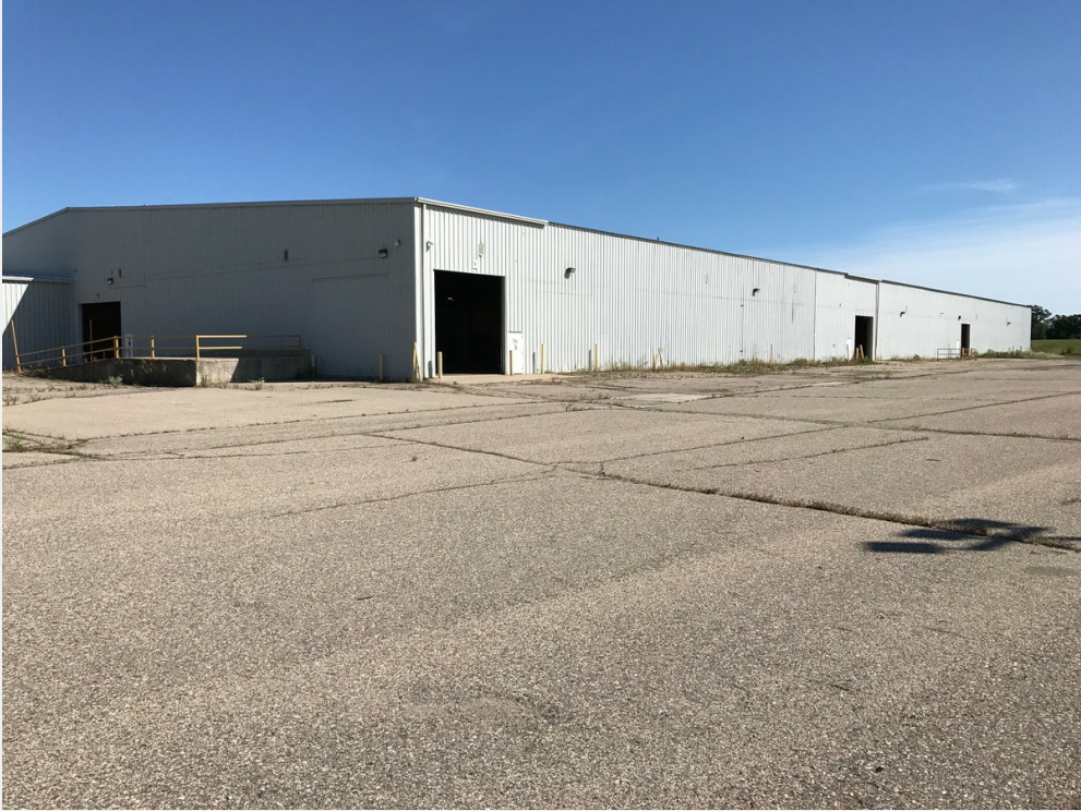
Mfg Section of Bldg - Front view