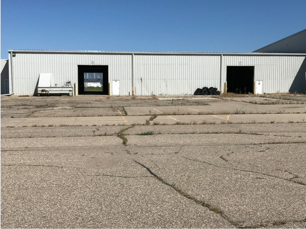
Warehouse Section of Building with 3 drive-in doors and 2 loading docks