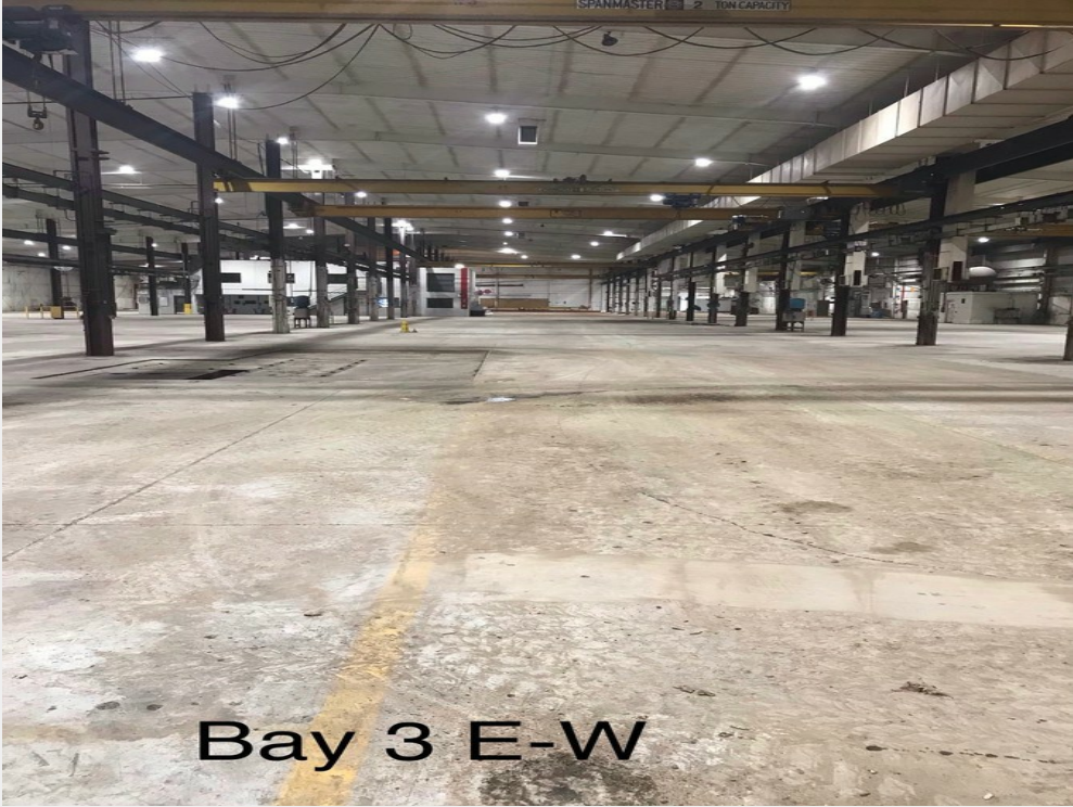
Bay 3 E-W