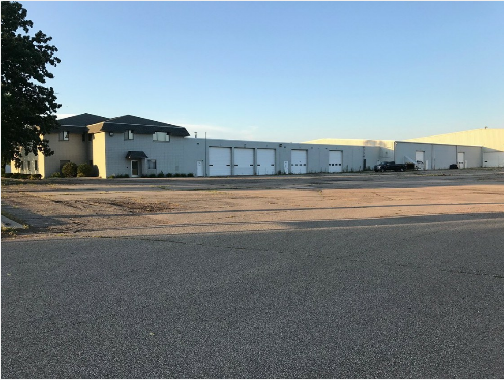
Overall view of front of Building