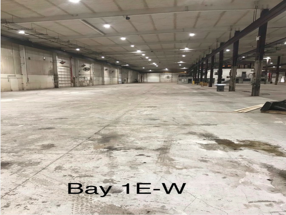
Bay #1 with 5 & 10 Ton Crane