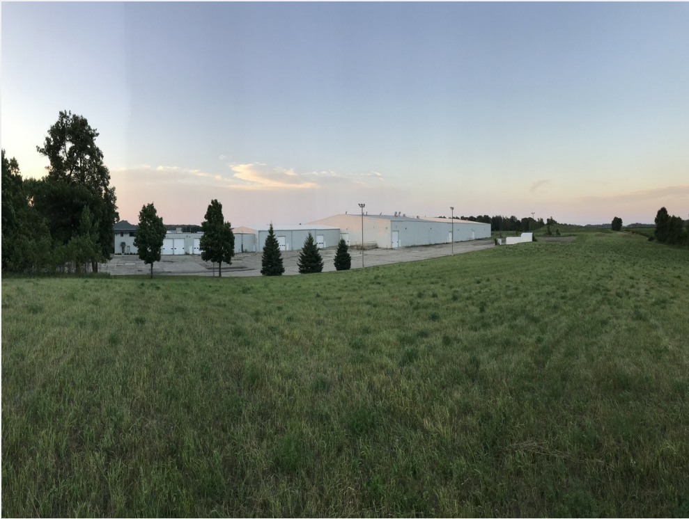
Entire Building with Parking Lot