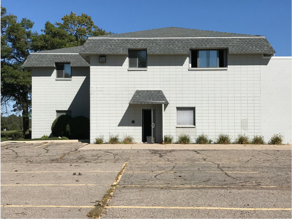
Office Section of Building