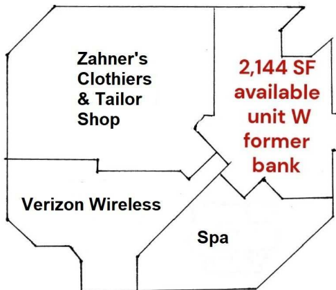
Shops at 30 Annex Hartford Turnpike Vernon, CT