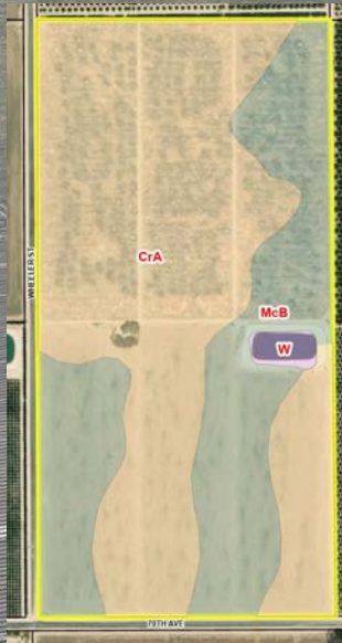
77.3 AC AVENUE 70 RANCH