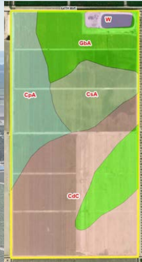
80 AC MR. GRAPE 4 RANCH