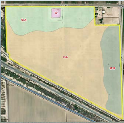
102.71 AC HAMMOND RANCH