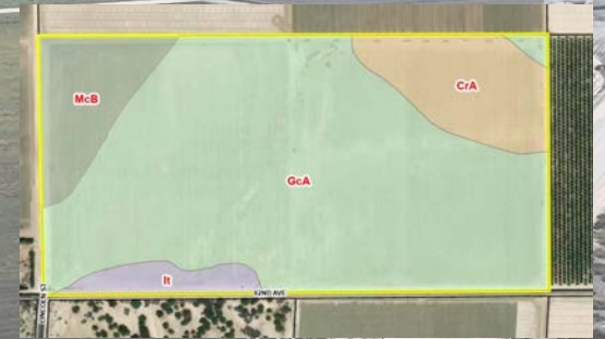
81 AC LINCOLN RANCH