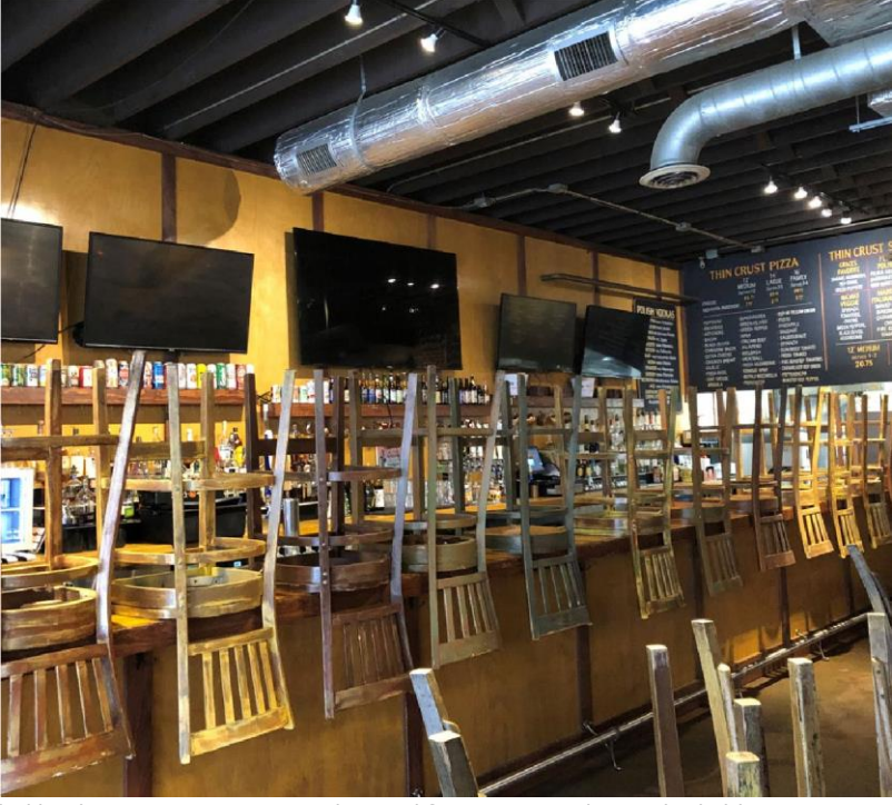
Agent Owned Property. The information contained herein has been provided by the property owner or obtained from sources deemed reliable. We make no representation or warranties, expressed or implied, as to the accuracy of the information. Buyer must verify the information and bears all risk for any inaccuracies.