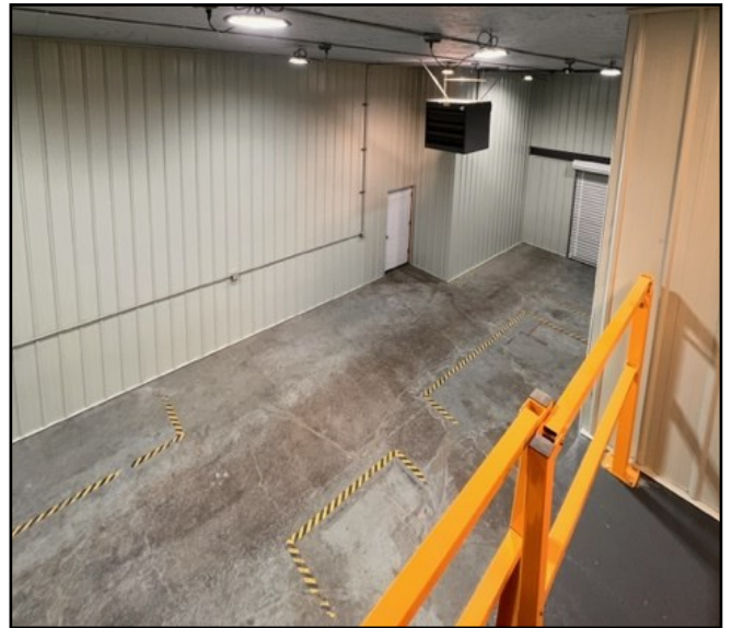
View from Second Story