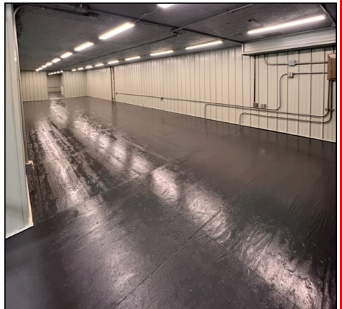
Second Story Warehouse

For additional information on this property please contact: