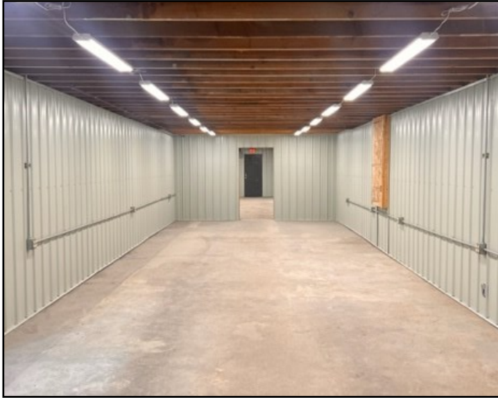
First Floor Warehouse