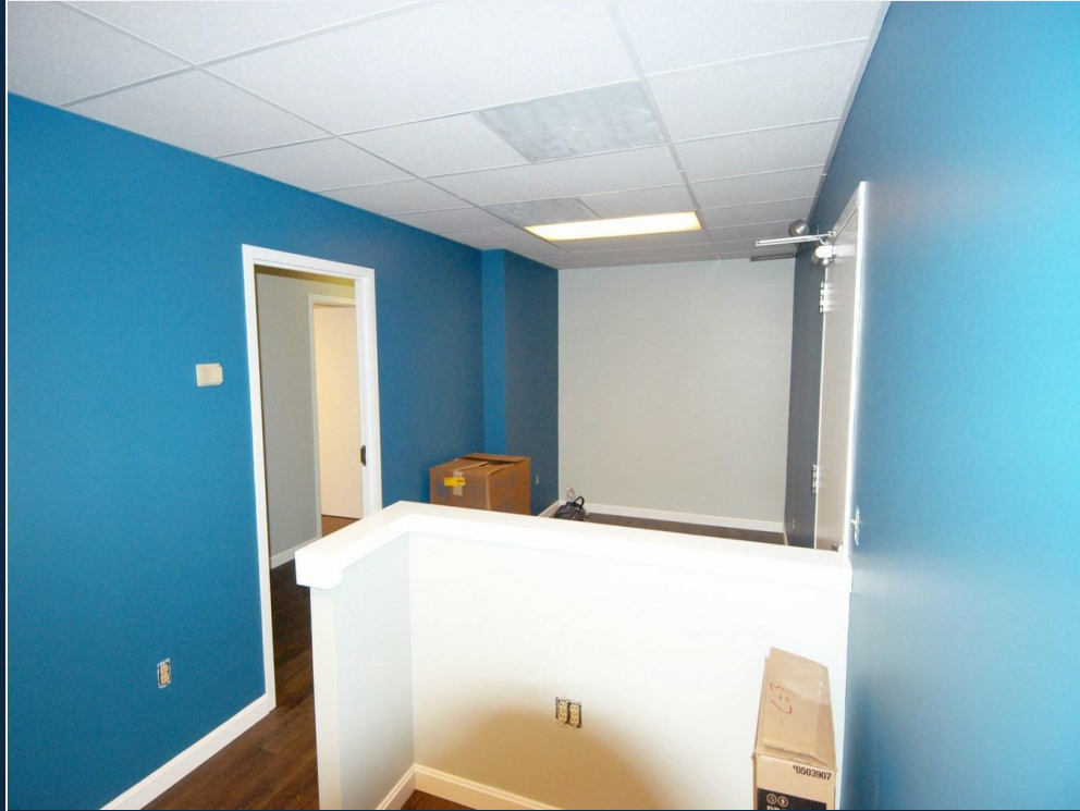
waiting area and reception