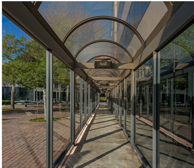
Covered Walkway to Parking Garage