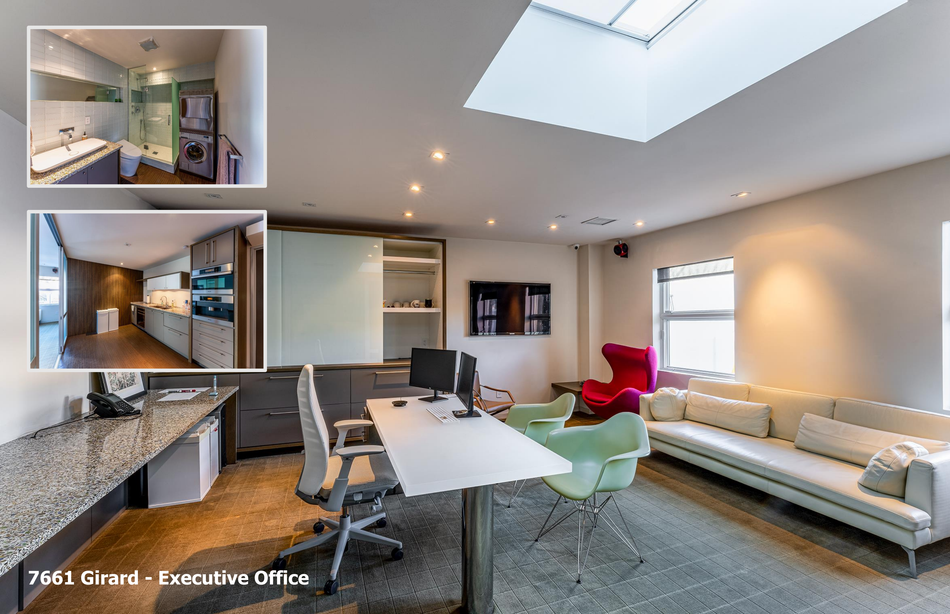
7661 Girard - Executive Office