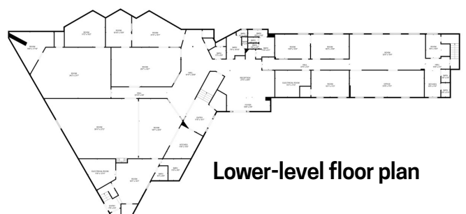
Lower-level floor plan