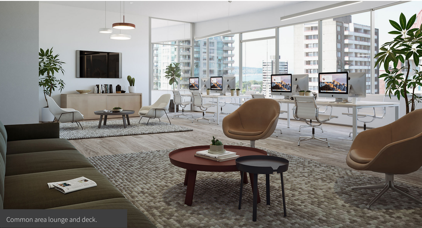
Common area lounge and deck.