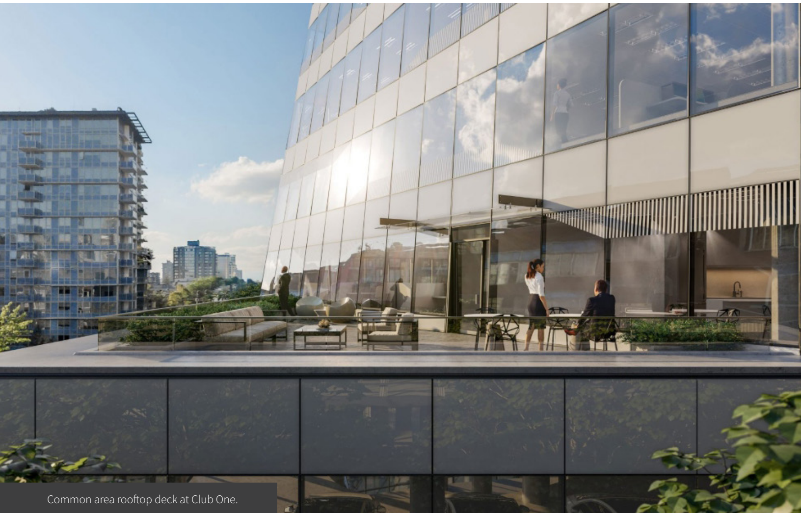
Common area rooftop deck at Club One.

Burrard Place creates a new centre of activity in Downtown Vancouver and with the unmatched combination of a luxury residential tower above, extensive lifestyle amenities and the finest interior finishes, the Offices at Burrard Place delivers a new level of sophistication to office ownership in Downtown Vancouver.