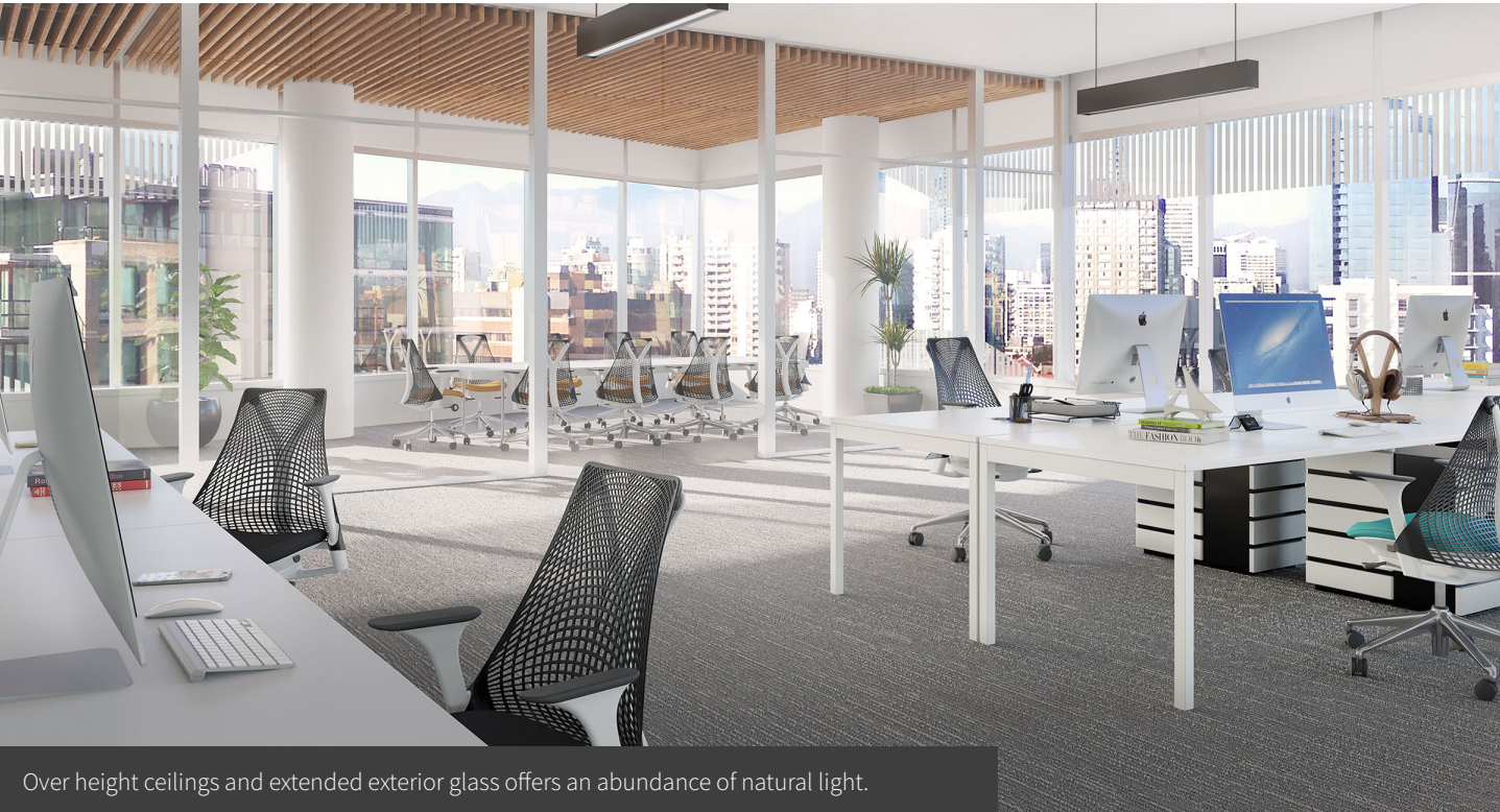
Over height ceilings and extended exterior glass offers an abundance of natural light.