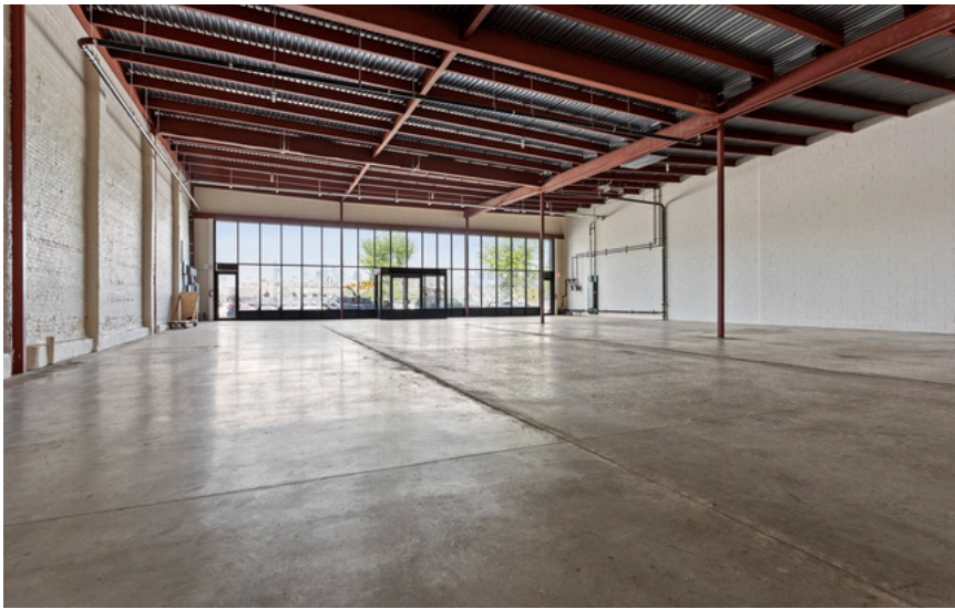
55 Kent Avenue