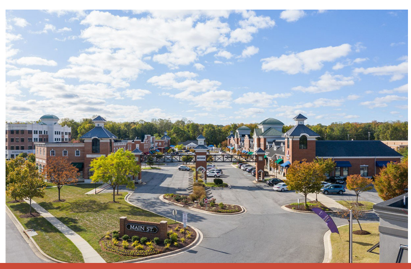
Treat yourself on Main St.