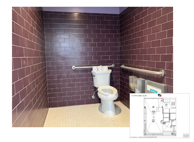
All information herein is offered in good faith and deemed accurate, but not guaranteed.