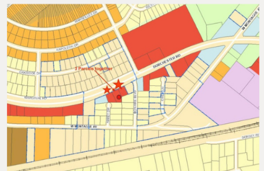
Est 25,000 Daily Traffic Count