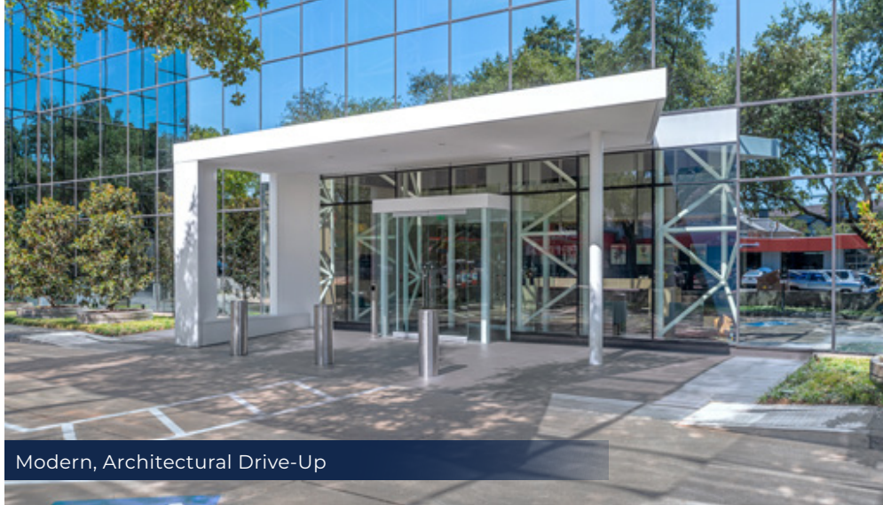
Modern, Architectural Drive-Up