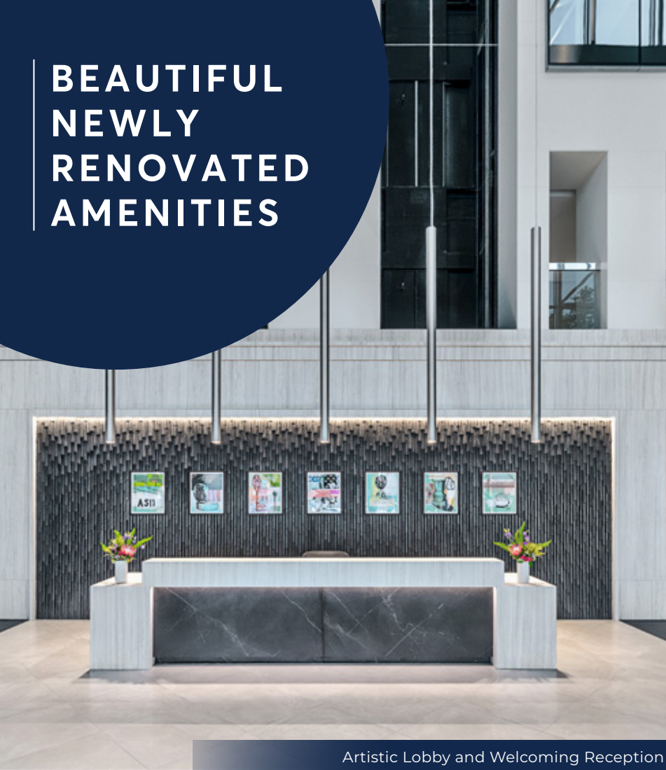
Artistic Lobby and Welcoming Reception