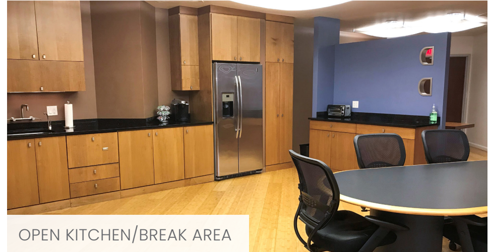
OPEN KITCHEN/BREAK AREA

RM FRIEDLAND COMMERCIAL REAL ESTATE SERVICES