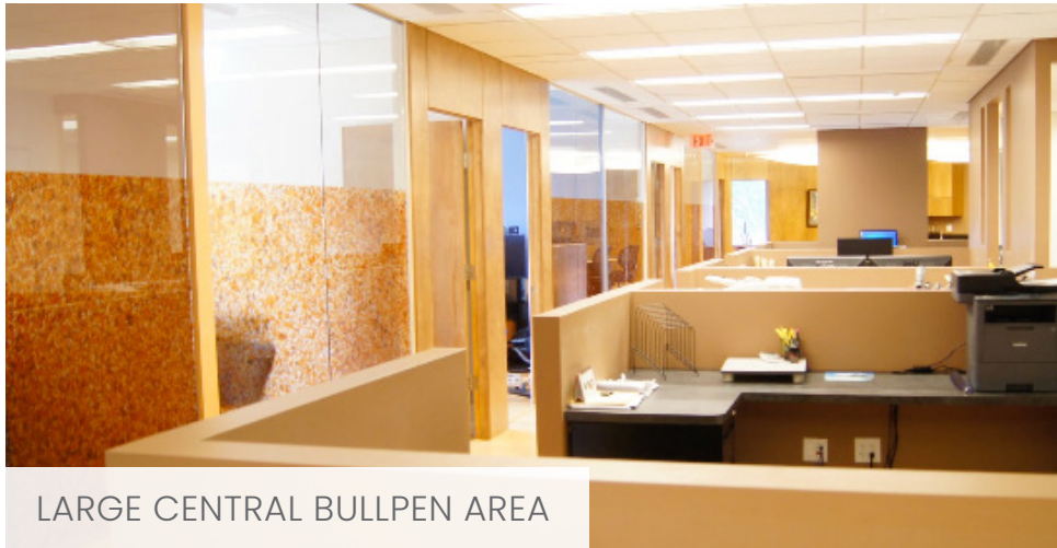
LARGE CENTRAL BULLPEN AREA