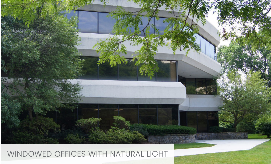
WINDOWED OFFICES WITH NATURAL LIGHT

SALE PRICE: $1,225,000 - RENT PRICE: $28/RSF