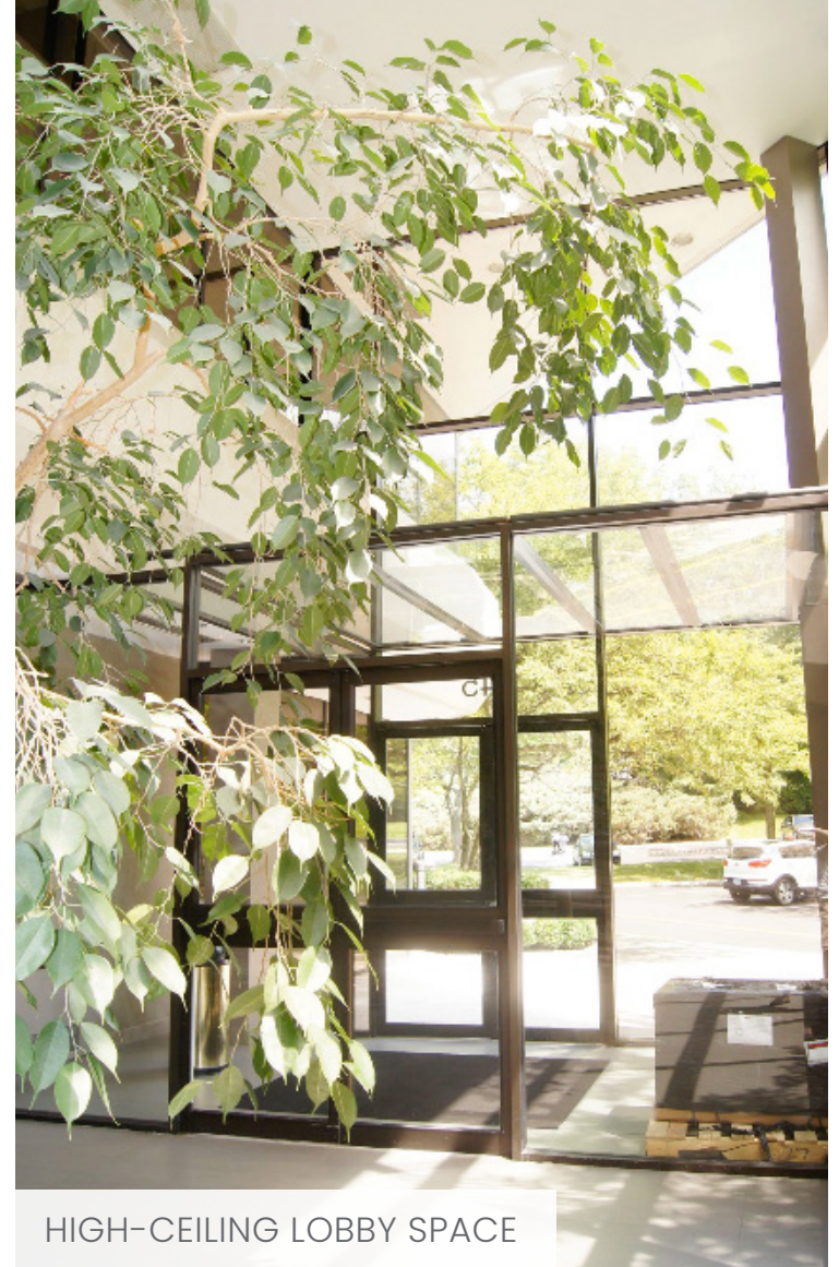
HIGH-CEILING LOBBY SPACE

RM FRIEDLAND COMMERCIAL REAL ESTATE SERVICES