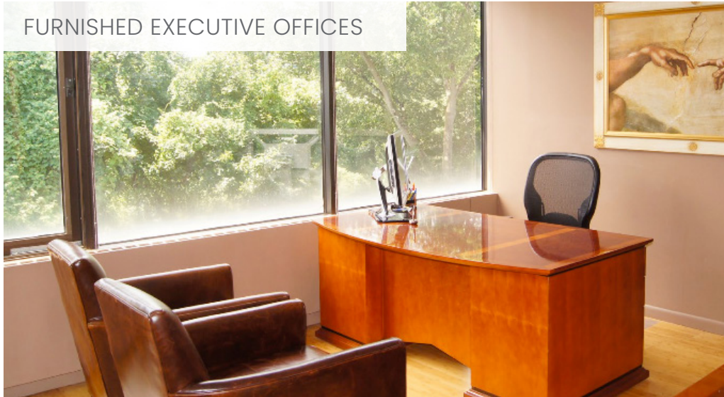
FURNISHED EXECUTIVE OFFICES