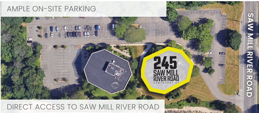
DIRECT ACCESS TO SAW MILL RIVER ROAD