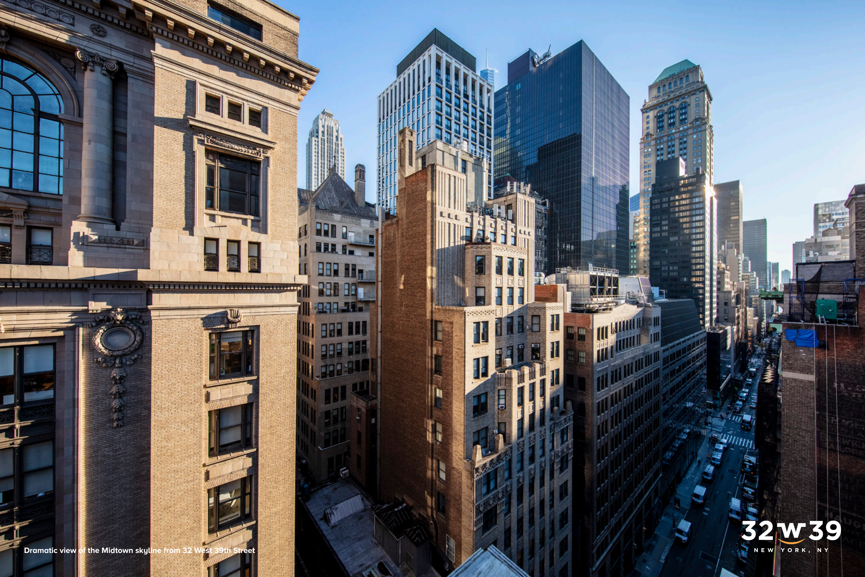
Dramatic view of the Midtown skyline from 32 West 39th Street