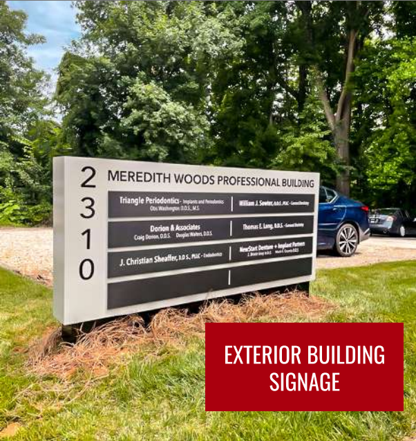
EXTERIOR BUILDING SIGNAGE