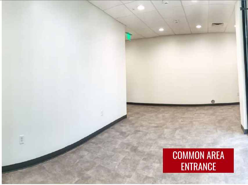
COMMON AREA ENTRANCE