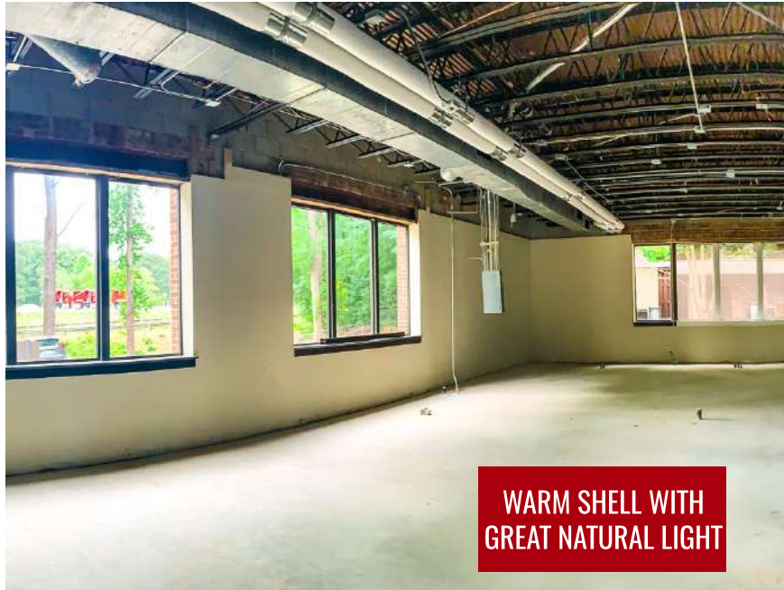
WARM SHELL WITH GREAT NATURAL LIGHT