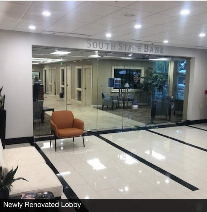
Newly Renovated Lobby