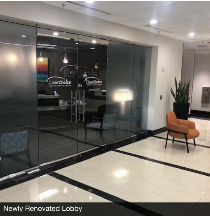
Newly Renovated Lobby