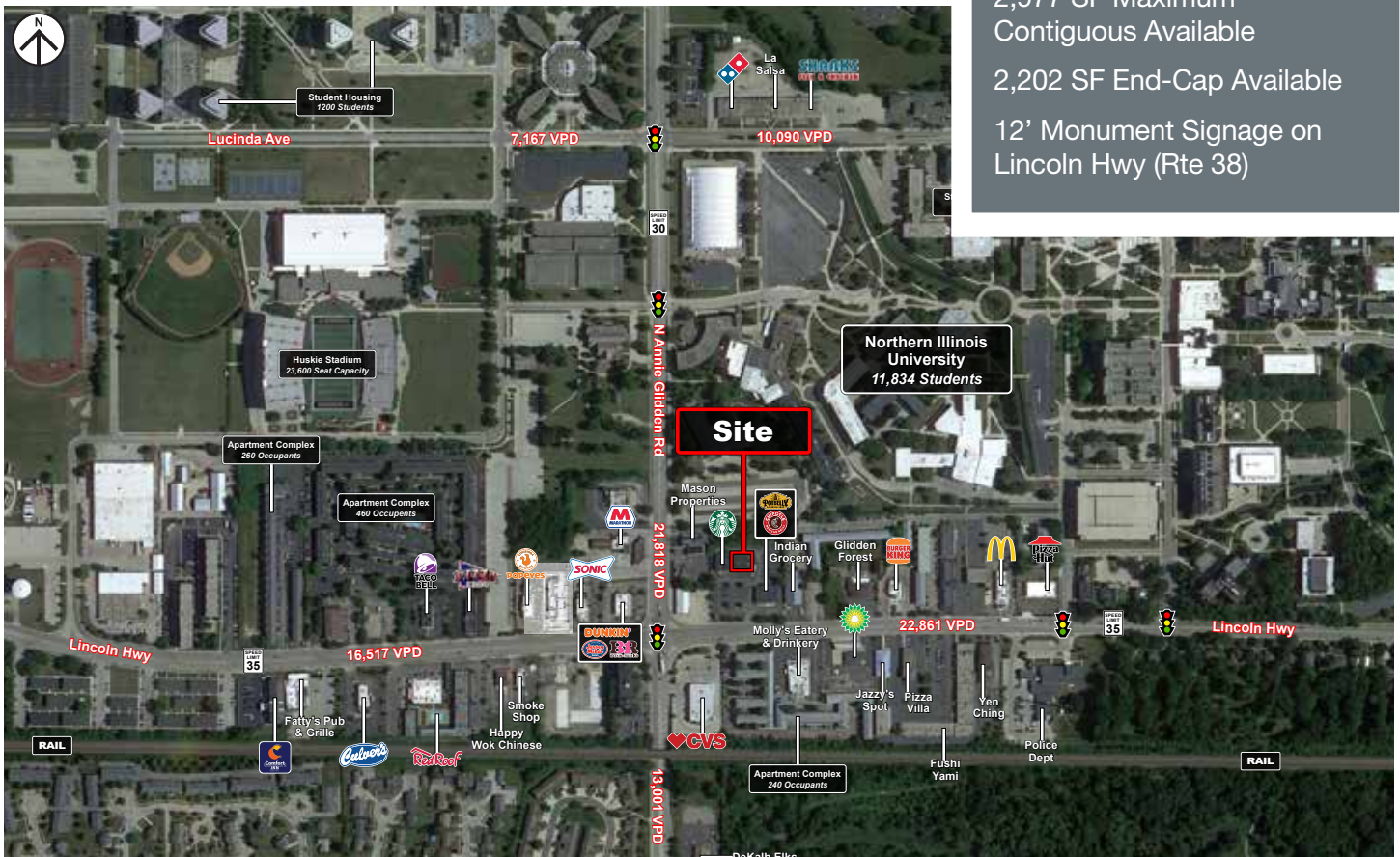
Sales Data Sourced from Restaurant Trends

12' Monument Signage on Lincoln Hwy (Rte 38)